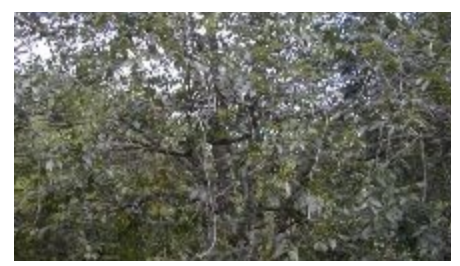
Casimiroa edulis specimen at the Nairobi Arboretum, Kenya.

There is a great variation in the amount of pollen produced by seedlings and grafted cultivars. Some flowers bear no pollen grains; others have an abundance. Sterile pollen or lack of cross-pollination are suggested causes of aborted seeds and heavy shedding of immature fruits.