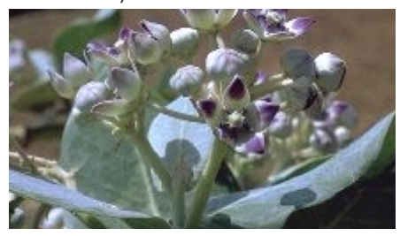
Calotropis procera flowering shoot