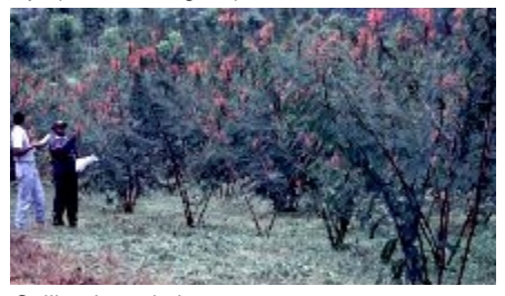
Calliandra calothyrsus: Fodder bank: Farmer with Calliandra row in Embu, Kenya.