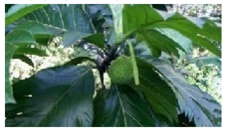
Fruits and foliage