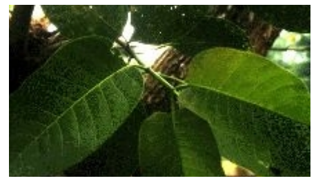
Anthocephalus cadamba leaves (Rafael T. Cadiz)