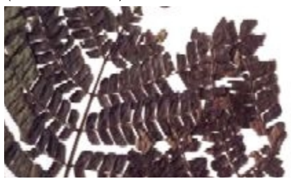
The leaves are paripinnate with 4-8 pairs of pinnae, each bearing 6-12 pairs of leaflets.

The pods and leaves of A. gummifera.