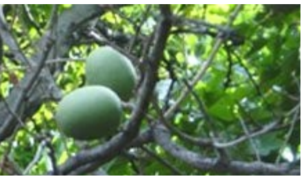
Fruits (Trade winds fruit)

In India flowering occurs in April and May soon after the new leaves appear and the fruit ripens in 10 to 11 months from bloom–March to June of the following year.