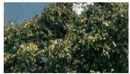
Tree with immature fruits. (Gifu University)