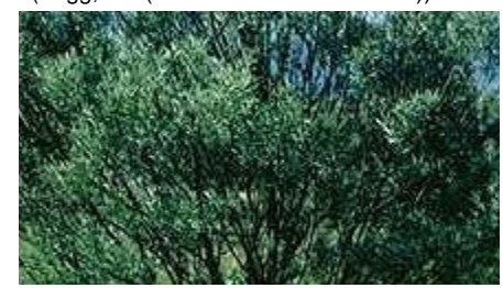
(Fagg, M. (ANBG Photo No.: a.9918))