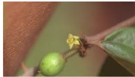
Ziziphus mucronata fruit

Z. mucronata is a hermaphroditic species. In South Africa, flowering is from October to April and fruiting from February to August.