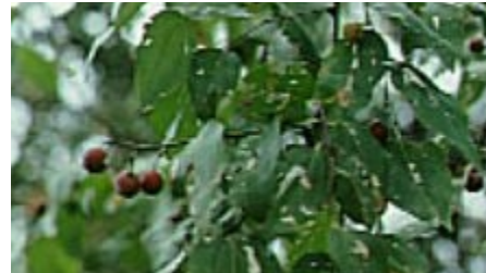
Ziziphus mucronata