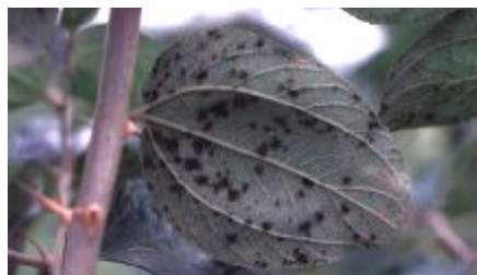
Ziziphus mauritiana slash