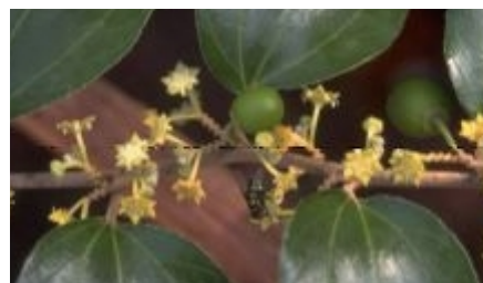
Z. mauritiana fruit and leaves. (Anthony Simons)

Some cultivars attain anthesis early in the morning, others do so later in the day. The flowers are protandrous. Hence, fruit set depends on cross-pollination by insects attracted by the fragrance and nectar. The pollen of the flower is described as 'heavy and thick'. In India, different species of honeybees ( Apis spp.) and house flies ( Musca domestica ) are reported to be important pollinators; the wasps Polistes hebraeus and Physiphora spp. have also been observed on flowers. Cross-incompatibility occurs, and cultivars have to be matched for good fruit set; some cultivars produce good crops parthenocarpically. Fruit development takes 4 months in early cultivars to 6 months in late ones. In Southeast Asia, Z. mauritiana flowers concurrently with shoot growth in the wet season. Mammals and birds disperse the fruits.