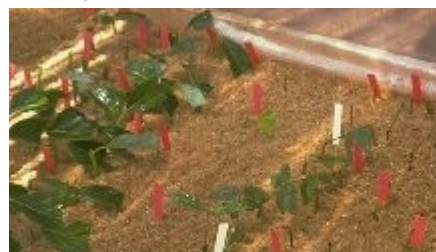
Z. mauritiana cuttings, Makoka, Zambia