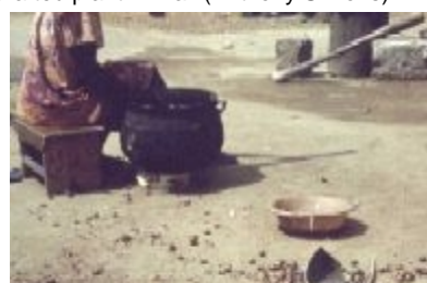
In West Africa, fresh, de-pulped sheanuts are usually par-boiled (thought to destroy germination enzymes and fungal infections) prior to sun-drying and de-corticating. (Lovett)