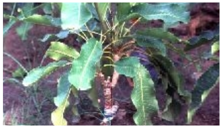
Grafted plant in Mali