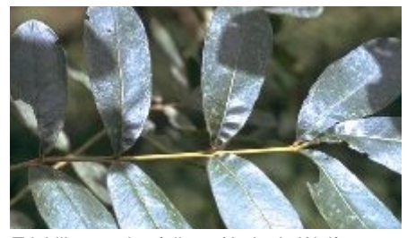
Trichilia emetica foliage