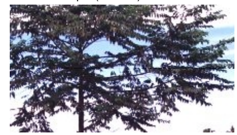
A large specimen of the pigeonwood tree which has been spared during forest clearing. (Ellis RP)