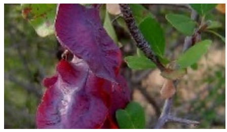
Leaves (Bart Wursten)

Trees flower form spring to summer in South Africa, while in Kenya, trees flower in years with normal climatic conditions from March to June. After pollination by insects, fruit development takes about 5-6 months. Brownheaded parrots eat the fruits, and probably disperse the seeds.