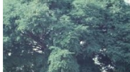
Tamarindus indica