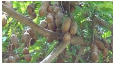
Fruits showing sticky pulp around seeds. (Anthony Simons)