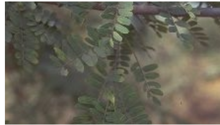
Tamarindus indica foliage (Joris de Wolf, Patrick Van Damme, Diego Van Meersschaut)

Flowering generally occurs in synchrony with new leaf growth, which in most areas is during spring and summer. The hermaphroditic bisexual flowers are probably insect pollinated; however, no specific information has been found on pollinating agents, except that honeybees collect nectar and pollen from the flowers so, presumably, they contribute to pollination. T. indica usually starts bearing fruit at 7-10 years of age, with pod yields stabilizing at approximately 15 years. Fruits are adapted to dispersal by ruminants; in Southeast Asia, monkeys are among the chief dispersal agents. Fruit are leathery, nutritive pods that do not dehisce until they have fallen from the tree, while the seeds are hard and smooth and therefore hard to chew.