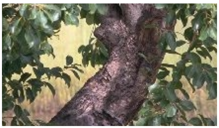
Syzygium guineense bark

Syzygium guineense foliage