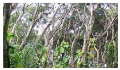
Part of the Reserve forest; the main tree here is the 'jamelão' (Myrthaceae). The jamelão was introduced to very wet areas of the Reserve in order to reduce the high water table. (Griffee P.)

S. cuminii is never leafless in moist localities; the coppery new leaves start even before the old leaves fall. However, in dry localities, it becomes leafless for a short time in the hot season. In its natural habitat, leaves usually start falling about January and continue doing so through to March. The flower panicles appear from March to May, and fruits ripen in June to August. S. cuminii is pollinated by honey bees, house flies and wind. Fruit formation takes place about 32 days after flowering. In areas experiencing a northeast monsoon on the east coast, the fruits are said to ripen from the middle of August to the middle of September. The fruits are devoured by birds, squirrels and humans and are therefore widely dispersed.