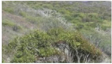
Habit at Waihee Pt, Maui, Hawaii