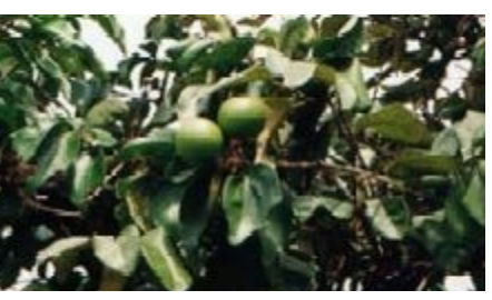
Strychnos cocculoides

S. cocculoides flowers during the rainy season, and the fruit ripens in the dry season. It takes 8-9 months from flower fertilization to fruit ripening.