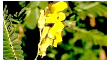
S. sesban flowers (Anthony Simons)

S. sesban is assumed to be largely out-crossing, however interspecific hybridization is reported with S. goetzei ; the carpenter bee is its main pollinator. Flowering starts shortly after the onset of the rains (in areas where there are 2 rainy seasons, it flowers and sets fruit twice). Pods are indehiscent and do not shed their seeds until well after pod maturity.