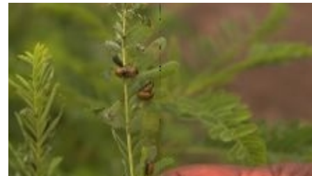
S. sesban Mesoplatys beetle attack.