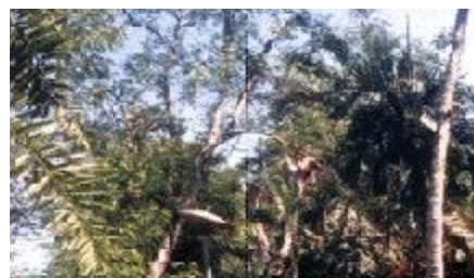
Ornamental tree

S. siamea starts flowering and fruiting at the age of 2-3 years. Once established, it flowers precociously and abundantly throughout the year.