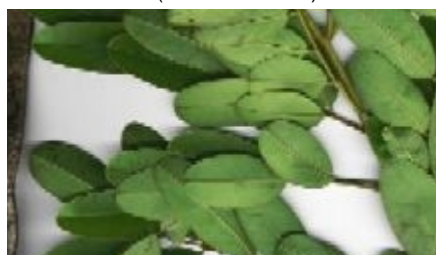
Plant with flowers and pod at Hamakuapoko Maui, Hawaii