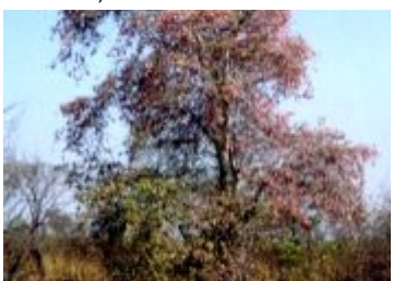
Securidaca longepedunculata flowers