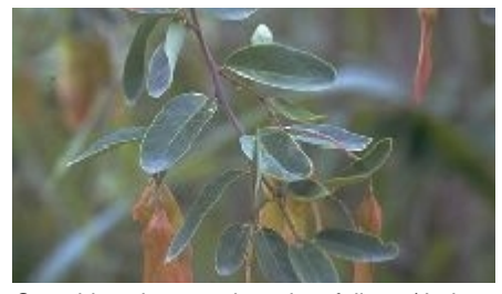
Securidaca longepedunculata foliage