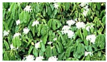
Saba comorensis