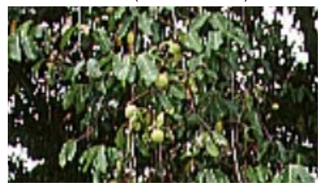
Saba comorensis