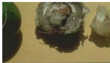
Ton fruit (French B.)

Bisexual and male flowers are reported to occur on a single tree of P. pinnata , but the structurally hermaphrodite flowers are functionally female with no anther dehiscence. Both cross-fertilization and self-fertilization occur. Usually there are 3-4 times as many male as female flowers. Dispersal of the fruits is probably mostly by bats and birds.