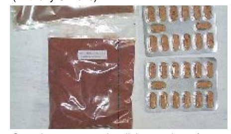
Over-the-counter aphrodisiac products from yohimbe. (Anthony Simons)