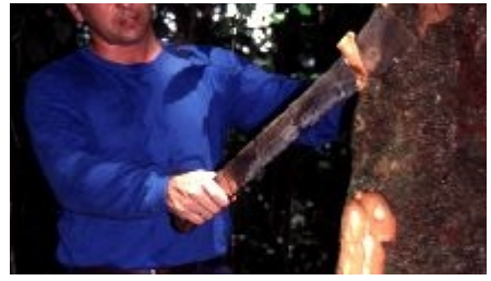
Taking slash bark samples from johimbe trees near Kribi, Cameroon. Red colouration develops after a few minutes. (Vanessa Simons)

The seeds are wind dispersed and their lightness and winged structure means that they can travel long distances, even in the mildest of breezes. The reproductive system is entomophilous.