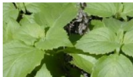
Leaves at Wailea 670 Maui, Hawaii (Forest & Kim Starr)

Flowering started after 136 days and continued until 195 days. Seed matured after 259 days. Flowering and seed set were much poorer than in O. basilicum L. or O. minimum L. In South-East Asia flowers can be found year-round. In northern India, oil content of young plants was low (2.3%) until the seed setting stage, then remained constant at 2.8% until the seed maturation stage.