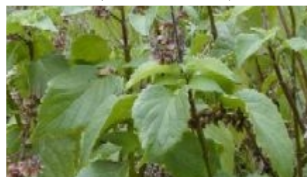
Leaves and fruit at Wailea 670 Maui, Hawaii