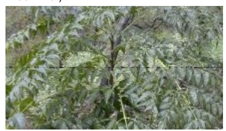
Habit at Wailea 670, Maui, Hawaii