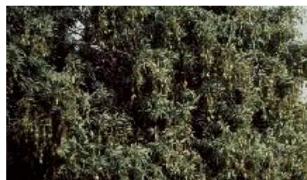
The mango tree, Mangifera indica , at the end of the dry season in Burkina Faso. While everything else is dry at this time of the year, this tree is dark green and full of juicy fruits. (Robert Zwahlen)

Rain and high humidity at blossoming reduce pollination and fruit setting. Usually only small proportions of the flowers develop into fruit. Hermaphrodite flowers are predominantly outcrossing and exhibit