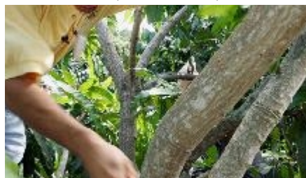
Grafted mango from Kodiaga Prison farm grown on farmers field in western Kenya