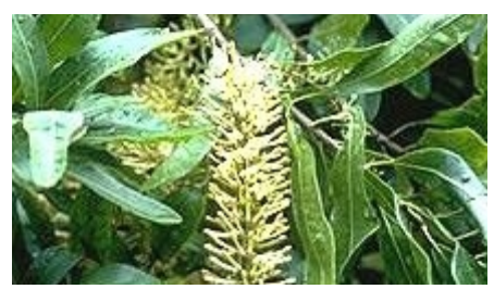
Flowers and foliage (Fagg, M. ANBG Photo No.: a.9845)

Pollination is by insects; most cultivars are at least partly self-incompatible. Planting pollinator trees and introducing bees are important for good fruit set. Fruitlets continue to be shed up to 2 months after bloom.