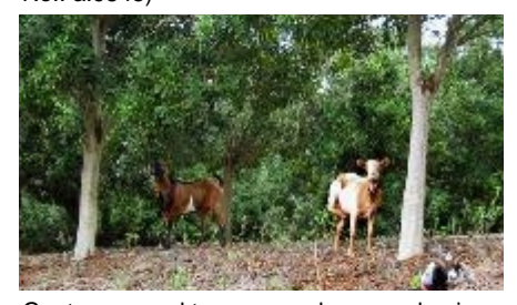
Goats are used to graze under macadamia nut trees where they control weeds without doing much damage to the trees or the hard nuts which fall to the ground when mature. (Craig Elevitch)