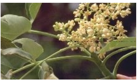
Khaya senegalensis flower

K. senegalensis is insect pollinated. Flowering shortly before or early in the rainy season, the fruit apparently remaining on the tree throughout the dry season. When the fruit ripens, the colour changes from grey to black. Begins to bear seed when the tree is 20-25 years old. Seed may be dispersed up to 100 m by prevailing winds.