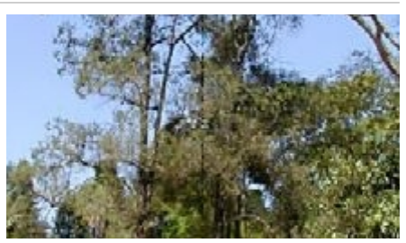
The entire tree at the Nairobi Arboretum.