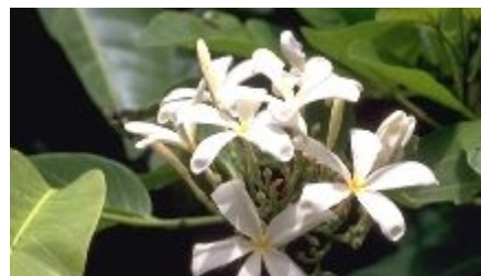
Holarrhena floribunda foliage and flowers.