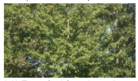
habit (Tamara Crupi, September 1996)