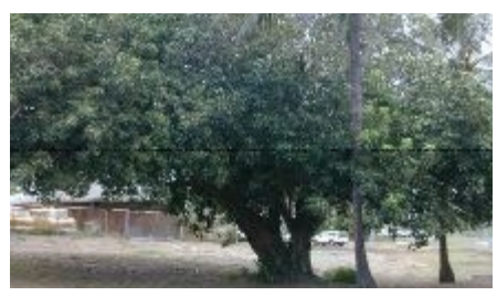
Habit at MCC Kahului, Maui, Hawaii

When seeds are dropped on other trees, they germinate. The seedlings rely on the host plant only for anchorage as F. religiosa does not parasitize on other plants. They derive their nutrition from the air and rainfall, until the roots reach the ground.