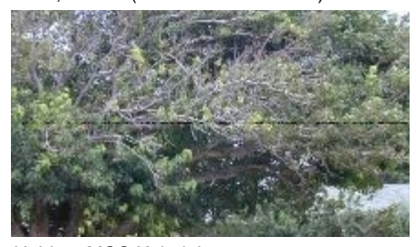
Habit at MCC Kahului, Maui, Hawaii