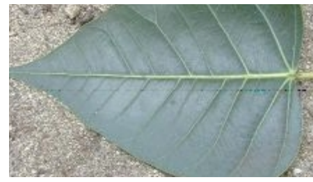
Leaf and fruit at MCC Kahului, Maui, Hawaii