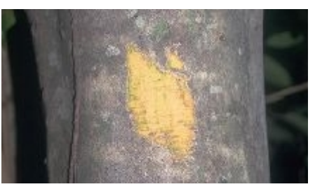
Dialium guineense slash

In Nigeria, the tree flowers from September to October and fruits from October to January. In Ghana, in September to November the tree is covered with small white flowers in panicles; fruit ripens in March to May but may be earlier and may persist longer. Animals, which like to eat the pulp in which the seeds are embedded, help disperse the fruit. However, the fruit can also be transported by water since it floats; transport by sea currents may lead to long-distance dispersal.