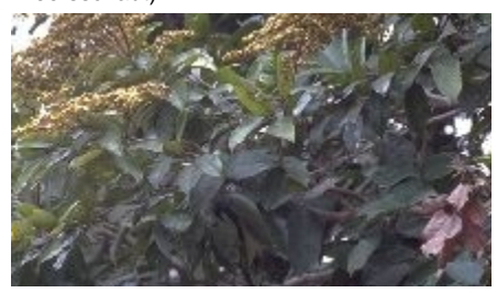
Dialium guineense foliage.