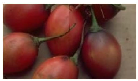
fruits (French B.)