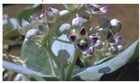
Calotropis procera flowering shoot