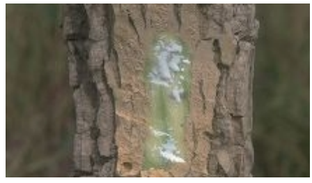
Calotropis procera slash

Highly cross-pollinated through insects such as monarch butterflies. Progeny genetically both divergent and different from its parents (chromosome number 2n = 22). Both animals and wind disperse seeds.