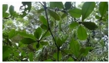
Habit at Keanae arboretum, Maui, Hawaii