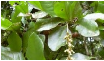
Flowers at Keanae arboretum, Maui, Hawaii

Flowering occurs throughout the year in Puerto Rico and in Florida it takes place in spring. Flowers may be staminate or perfect. Fruits mature in about 3 months, are light, easily blown away by strong winds and float on water.