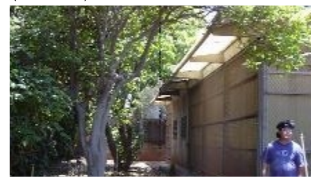
Habit at State nursery Kahului, Maui, Hawaii

Star fruits in the market. Thanks to The Foundation of Agricultural Development and Education for permission to use this picture (Tanaka Y.)