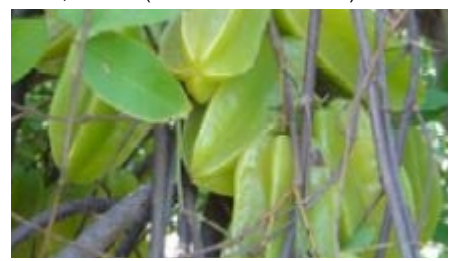
Leaves at State nursery Kahului, Maui, Hawaii