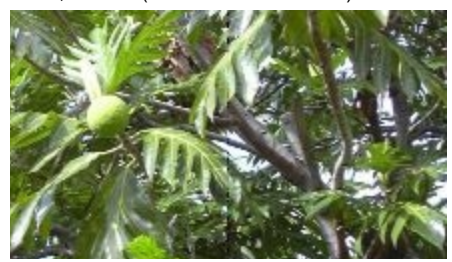
Leaves and fruit at Puehuihueiki cemetary Lahaina Maui, Hawaii