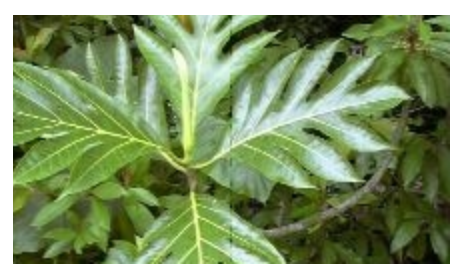
Habit at Keanae Arboretum, Maui, Hawaii (Forest and Kim Starr)

Honeybees have been observed actively working the male inflorescence and collecting pollen, especially from fertile, seeded accessions. Other insects such as earwigs have also been observed on the male inflorescence. Only a few flowers in the male inflorescence of seedless A. altilis produce and release pollen. Pollen grains from fertile cultivars are uniformly shaped and stain well, while triploid cultivars have the lowest pollen sustainability, averaging 6-16%. Pollen grains are typically malformed, clumped and poorly stained. A. altilis is diploid (2n = 56) and triploid (2n = 84).