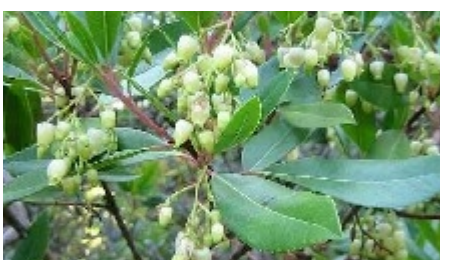
Flowers and leaves ( Strybing Arboretum, Golden Gate Park, San Francisco, CA.)

Strawberry flowers are hermaphrodite, self-fertile and pollinated by bees. It begins blooming in autumn and continues into the winter. The fruit takes 9-12 months to ripen hence both mature fruit and flowers are existent at the same time with an incredible beauty.