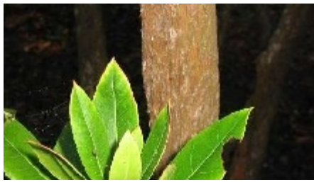
bark