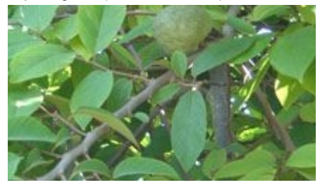
fruit and foliage (Trade winds fruit)