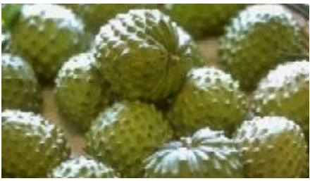
Ripening fruit (Trade winds fruit)