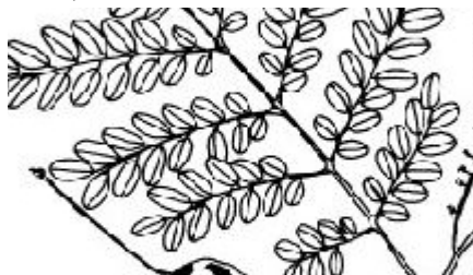
Adenanthera pavonina foliage (Rafael T. Cadiz)