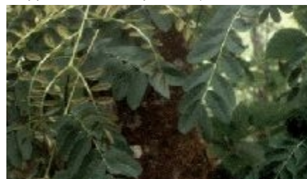
Adenanthera pavonina foliage (Rafael T. Cadiz)