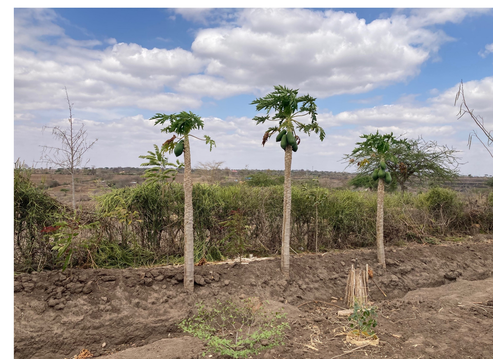
Figure 4. Pawpaw trees on a farm in Kitui.