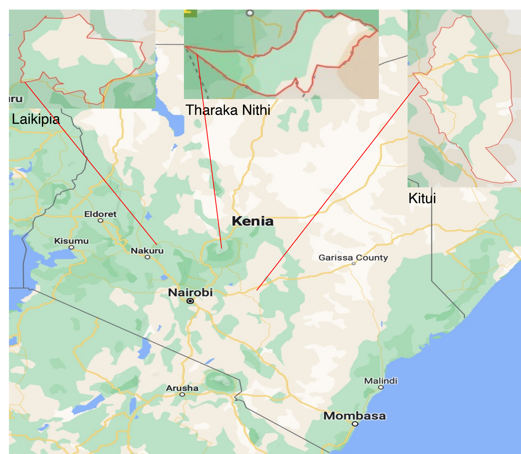
Figure 1. Study areas.