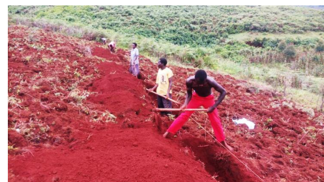
Figure 2: Constructing trenches along the slope to trap soil erosion is labor intensive in Mt. Elgon region.